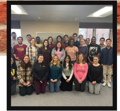
Programming and Outreach

In a contemporary world, and especially within an academic setting steeped into technology and engineering, Catholic students must have new and creative opportunities to deepen and articulate their faith and benefit from the rich Catholic intellectual tradition. These offer a framework for dealing with ethical issues related to their academic fields and a way to understand the power of grace and scripture to help students live out Christian life. Transforming the world with justice, peace and truth.