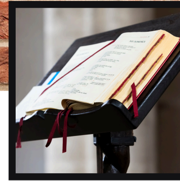
Faith and Reason

It is essential that our faith leaders focus on continuing the mission and ministry of Jesus to reach out to those in need with spiritual, emotional and practical support. Our priests and chaplains encourage and counsel students while establishing relationships in their formative years.